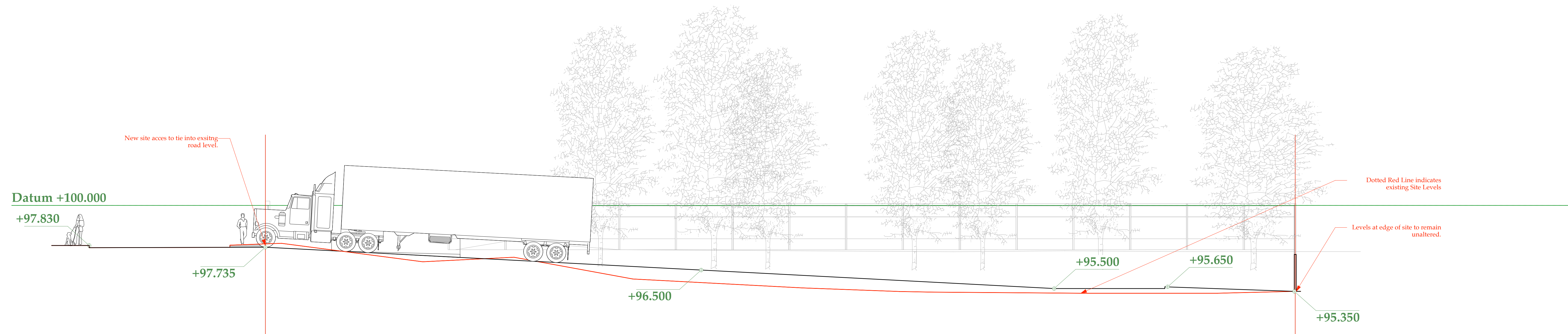
Proposed Section C-C

Rev A: 24.01.23 Page size and scale amended